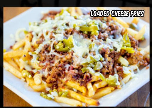
LOADED CHEESE FRIES