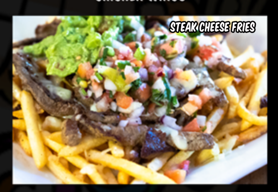
STEAK CHEESE FRIES