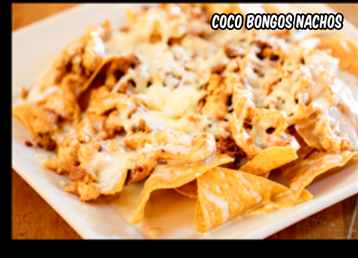
COCO BONGOS NACHOS

BEEF 12.99 CHICKEN 11.99 SHRIMP 14.99 Chips topped with grilled onions, tomatoes, bell peppers, shredded cheese and cheese dip